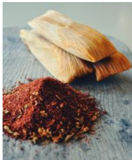
Ancho Chili Pork