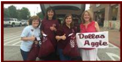
Spring 2016 Goody Bag delivery day!