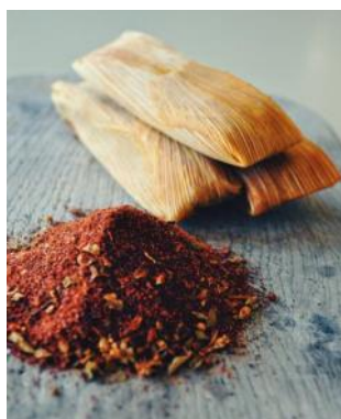
Ancho Chili Pork

Stove : Place unopened bag of tamales in boiling water, turn water down to a simmer for 20 minutes from frozen and 15 minutes if thawed. Only 4 or 5 inches of water are necessary as the tamales cook in the bag.