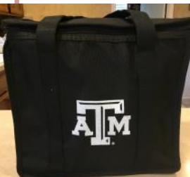
$6.50 Black bags are 12"Wx13"Hx7"D