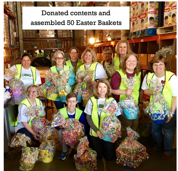
Donated contents and assembled 50 Easter Baskets