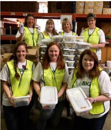
Donated and packed 25+ hygiene kits for teens

"Through service-oriented activities, The Big Event promotes campus and community unity as students come together for one day to express their gratitude for the support from the surrounding community."