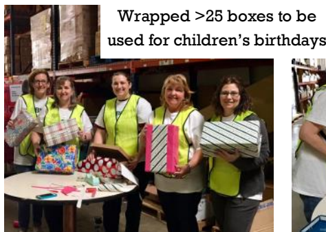
Wrapped >25 boxes to be used for children's birthdays